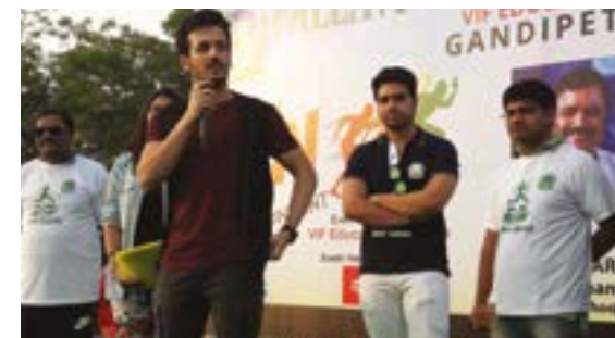
Mr. Akhil Akkineni Indian Actor