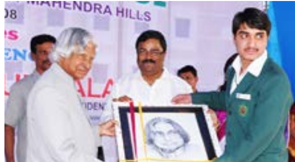
Shri A P J Abdul Kalam Ex - President of India