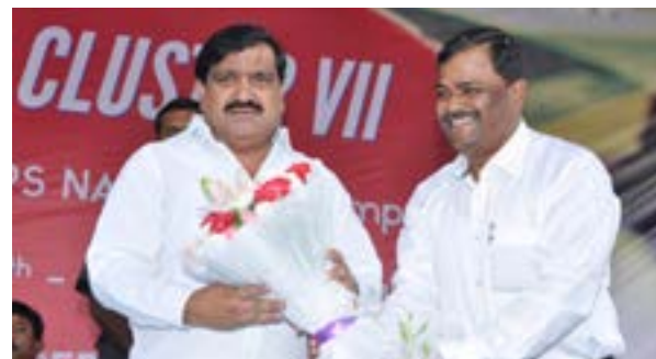
Shri P. Mahender Reddy Minister of Telangana Transport Department