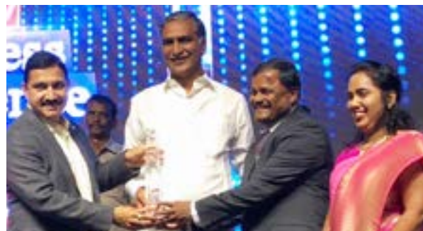
Shri Sujana Chowdary Minister of Science, Technology & Earth Sciences