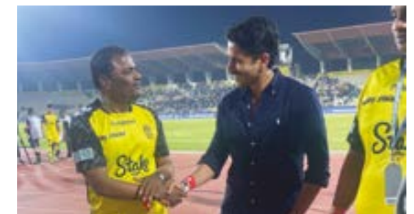
Mr. Naga Chaitanya Indian Actor