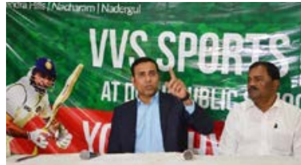
Shri V V S Laxman Former Indian Cricket Player