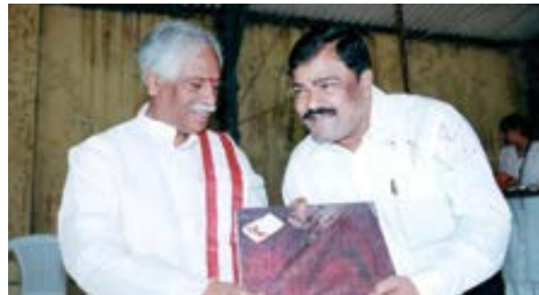
Shri Bandaru Dattatreya Minister of Labour & Employment