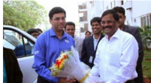
Viswanathan Anand Indian Chess Grandmaster