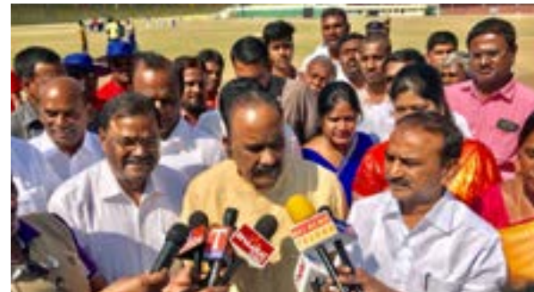
Shri Narasimha Reddy Home Minister of Telangana