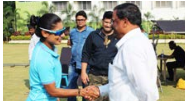
Ms. Mithali Raj Captain of Indian Women's cricket team