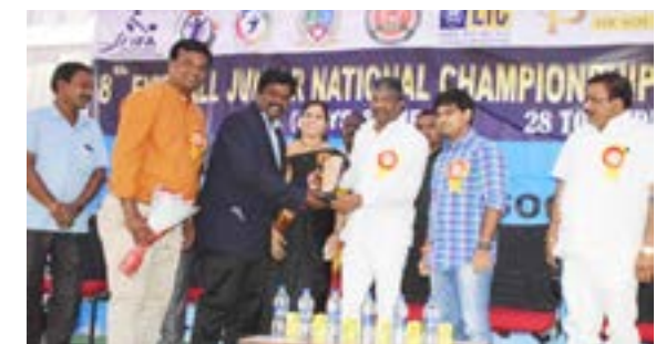
Shri T. Padma Rao Goud Sports & Exercise Minister